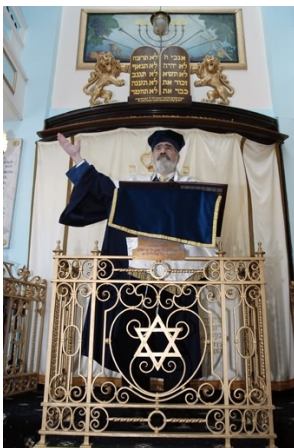
Image (right): The Chief Rabbi Dr Jonathan Sacks gives an impassioned speech at the centenary of the CoJ in June 2003.

Today we are diverse, with members from all types of trades and backgrounds. We are affiliated to three burial societies,, Adath, Chesed Ve'emeth and Federation, but we are most proud of the fact that we retain our independence, reflected by the fact that the synagogue is owned, managed and maintained by members of the community. Kehillas Ya'akov "is a remarkable survival ... and is all the more exceptional for continuing in use as a synagogue" (English Heritage Report).