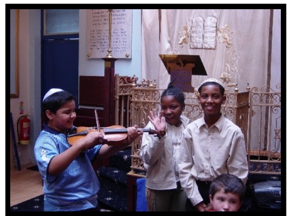
Children enjoy an InterFaith Klezmer workshop at the Congregation