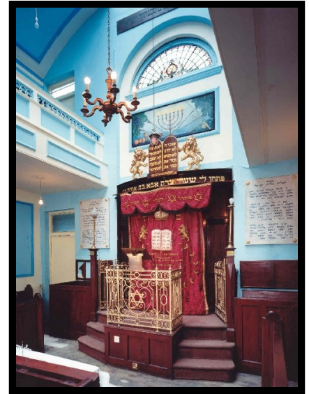
A view of the Aron HaKodesh during conservation

"It is an enormous delight to celebrate with you this lovely moment and I commend all of you, not for just keeping it going, but for keeping it strong and keeping the flame alight. For me coming here is like coming home because most of my early childhood was spent in Commercial Road. This is a very very proud tradition that you have sustained here. And what a mechiah it is that you have kept this shul alive and more than alive, you have renewed it. I want to give my congratulations to all of you who have had a share in it. You are preserving, conserving and renewing something that is unique. May your great great spirit lift everyone who enters your door. May you continue to be as warm and welcoming as you are today and may everyone who enters here to pray feel that they are not strangers here - here where they belong. May your future be no less distinguished than your past."