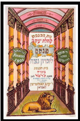
The Founding Document (1903)

Due to a number of grants from organisations including the World Monuments Fund, Rothschild Foundation (Europe), Heritage of London and the Veolia Charitable Trust we have been able to restore the synagogue back to its former glory. Come join us, to share the splendour!